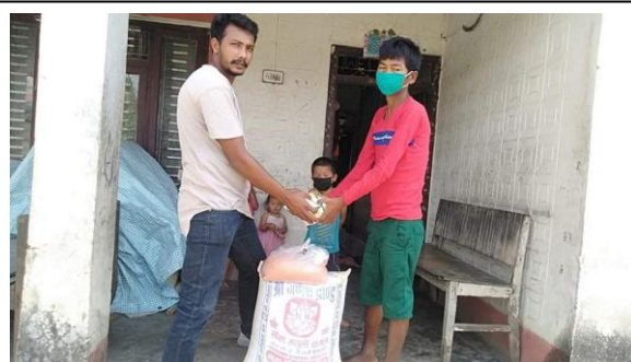
Relief package Supported to kidney patient family