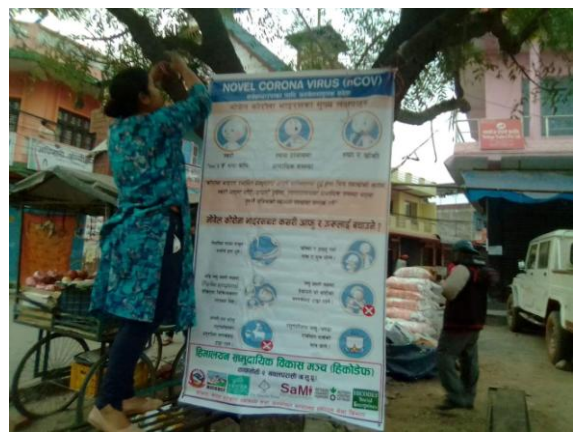
Supported to Binaye Triveni RMP