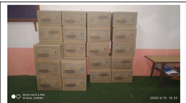
Soap store at HICODEF