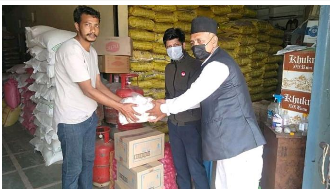
Supported to Devchuli Municipality