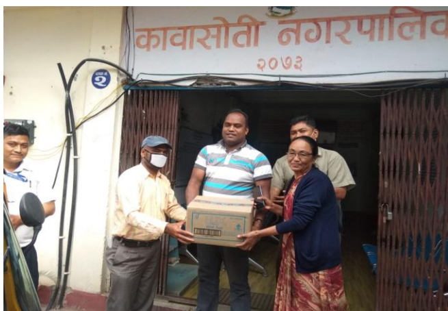
Handover to Mayor of Kawasoti MP