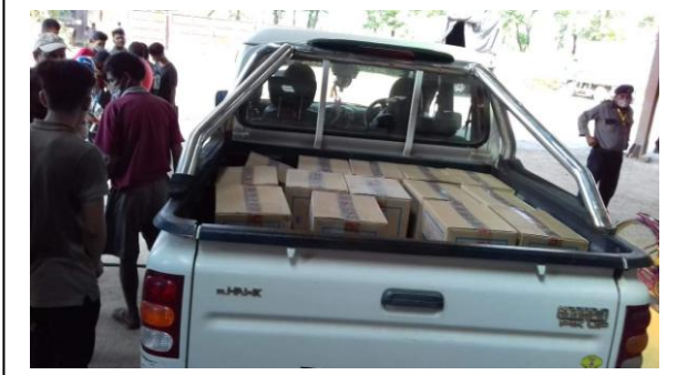
Soap transport to HICODEF Kawasoti