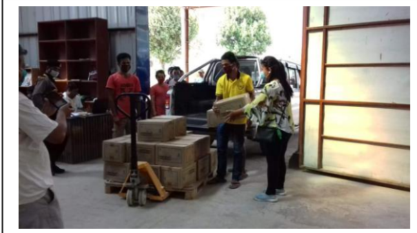
Soap collection from warehouse of Unilever